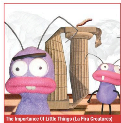
The Importance Of Little Things (La Fira Creatures)

EXODUS is on the roster of some 15 thrillers that UK company Jinga Films is looking to license either as a package or a thematic strain. The futuristic film stars Lord Of The Rings talent Bernard Hill as a neo-fascist politician who confines immigrants to a ghetto called Dreamland. The plot thickens when his adopted son discovers that his real parents are refugees.