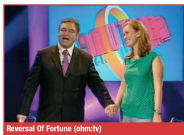
Reversal Of Fortune (ohm:tv)

GAME show Reversal Of Fortune is on offer at MIPTV as part of German company ohm:tv's line-up of programming. Ohm:tv holds the distribution rights for Europe, Australia, New Zealand, South Africa, the Middle East, Argentina, Brazil and Canada. The game show, produced by Channel X, is available in daily half-hour (daytime/access primetime) and one-hour (primetime) slots.