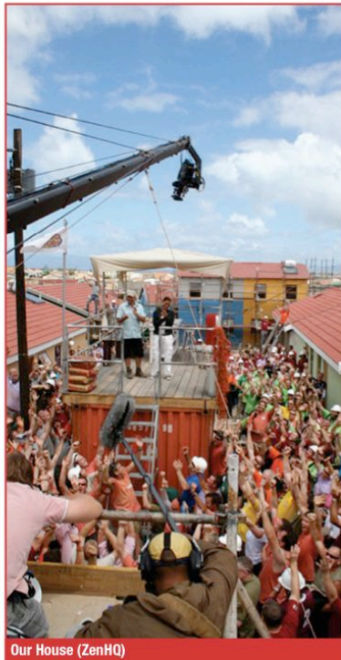
Our House (ZenHQ)

SOUTH African outfit ZenHQ is at MIPTV unveiling the HDTV series Our House , a reality TV challenge in which 200 homes are built in seven days.